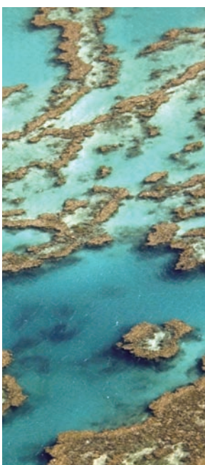
Commonwealth of Australia (GBRMPA)

This Report Card summarises present knowledge on marine climate change impacts and identifies knowledge gaps and adaptation responses in Australia. It was produced by an author team representing 35 universities and organisations, a project team from the CSIRO Climate Adaptation National Research Flagship, and a steering group comprising representatives from the sponsor organisations [National Climate Change and Adaptation Research Facility (NCCARF); CSIRO Climate Adaptation National Research Flagship; and the Australian Climate Change Science Program (ACCSP)].