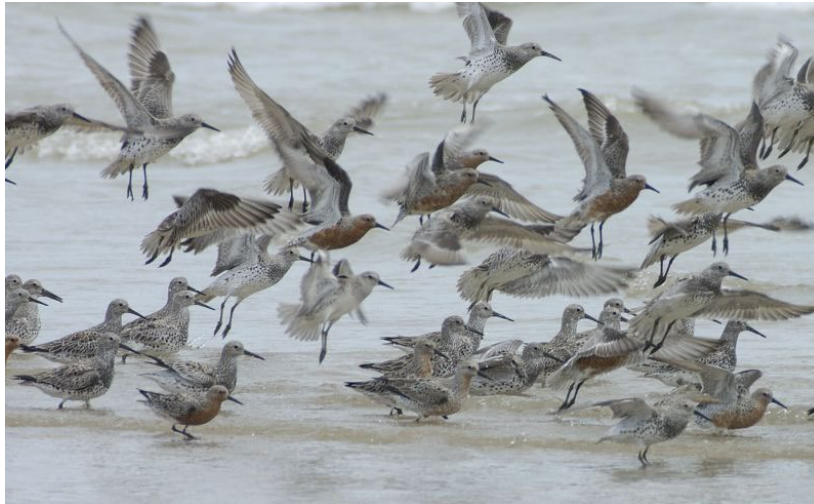
Migratory shorebirds (Great and Red Knots), Buffalo Creek, Northern Territory. Northern Australia remains a major, and importantly an increasing, refuge for migratory and non-migratory shorebirds, seabirds and waterbird populations (with the NT recording c. 50% of the national total). These populations are under major threat from climate change impacts on coastal habitats.

pressures will be compounded by global climate changes, such as altered rainfall regimes, rapid ocean warming, increased cyclonic activity (and storm surges), changing ocean chemistry and rising sea levels.