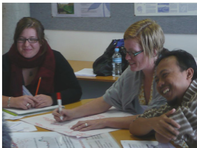
Students participating in workshop section of Summer School, 4 December 2009.

Feedback from participants was extremely positive as evidenced by the overall results from completed evaluation sheets. Results from a series of 13 questions using the Likert scale showed that participants were overall very happy with the organisation, course structure and content, and presentation of lectures (all scores ranged between 4.12 and 4.92 out of a possible maximum positive response of 5). Many positive comments were received from students, e.g. “Very well organised with excellent presentations. The speakers made difficult topics accessible and interesting. The whole day was very valuable!”