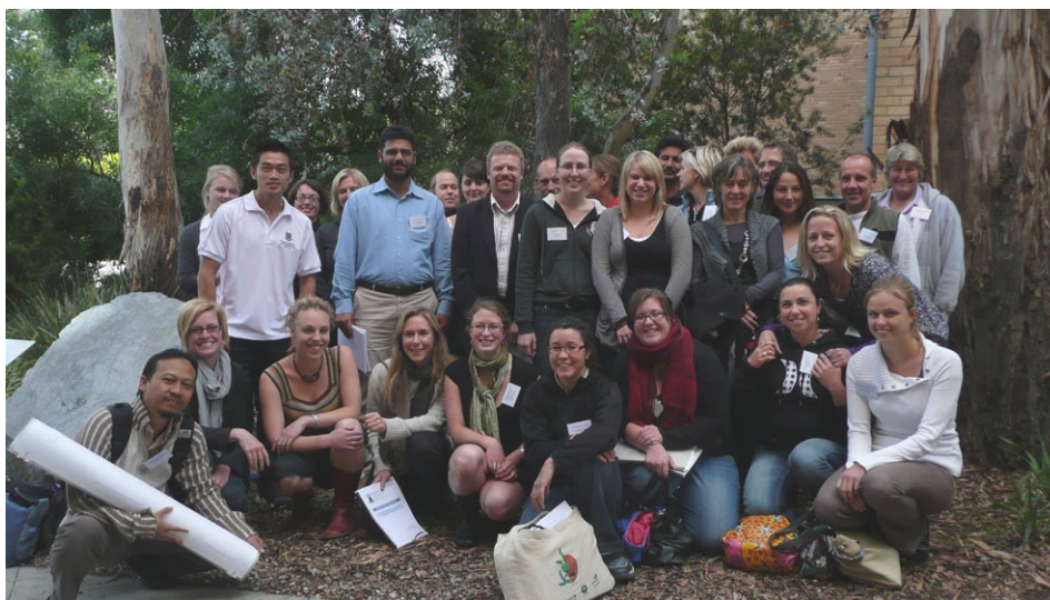
Students and some speakers at the First National Marine Climate Change Adaptation Summer School, 4 December 2009.

The Summer School was held in two sections: (1) a morning lectures session presented by seven leading researchers with expertise in climate change, variability and risk, marine biology, physical oceanography, policy, economics and social science, and (2) the afternoon mentored-workshop session